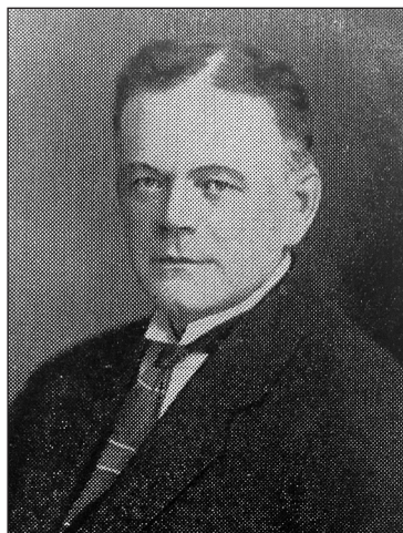
Fig. 1. B. V. Farmakovskiy (Фармаковская 1988, inside cover)

It should be noted that these were not purely declarative statements, recorded only on paper. The case was brought under some control and the Archaeological Committee monitored the conditions. Illustrative about this are the documents where in the correspondence the leadership of the AUAS, after the end of Olbian expedition of this year (probably based on unknown to us private sources of information), is interested in the directorate of the Mykolaiv and Odessa museums — do they know that part of things was exported by B. V. Farmakovskiy from Ukraine to Leningrad (SAIA NASU, f. AUAC, c. 263, p. 44—47)? The Odessa Museum unequivocally denies this fact and states that all things acquired in Olbia in 1924 are stored in the territory of Ukraine with the exception of only two ceramic fragments — a black-figured fragment and a lid of an Ionic vessel (is-